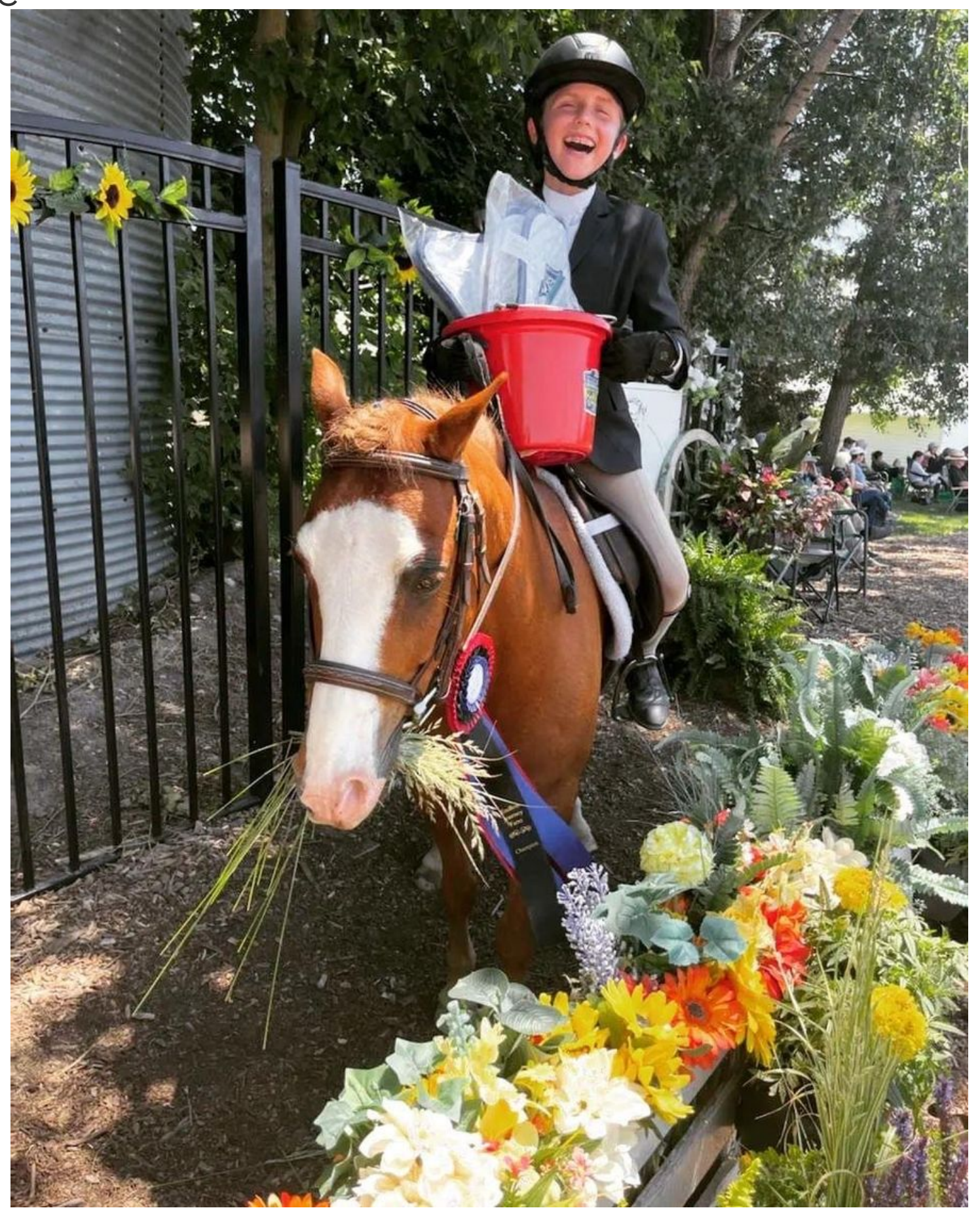
Table A Classic